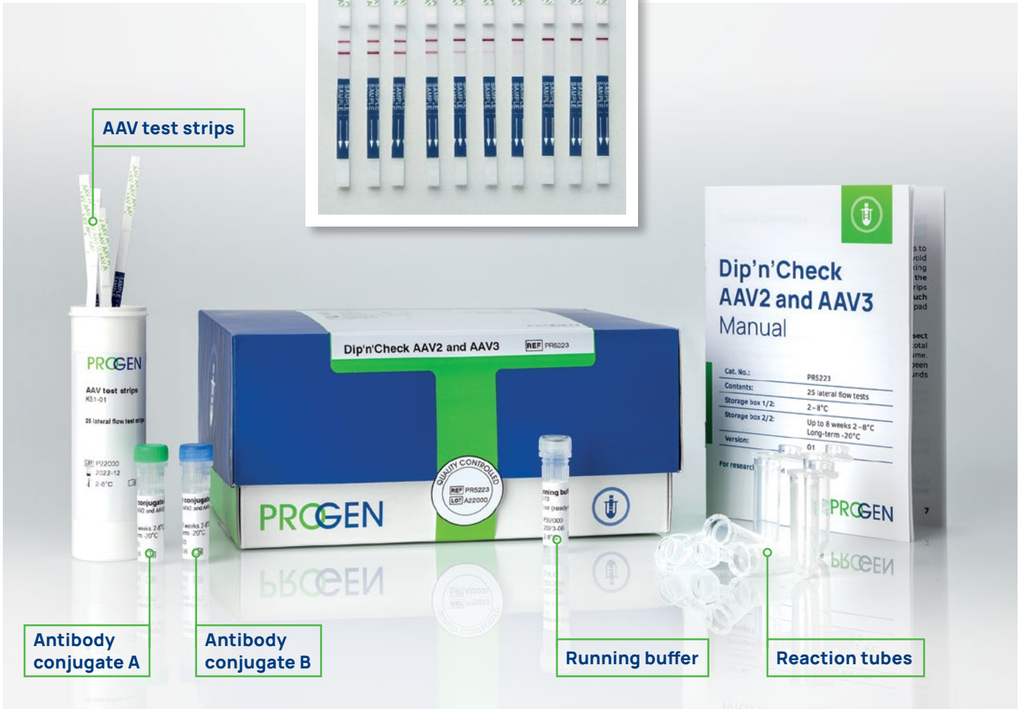
Antibody conjugate A