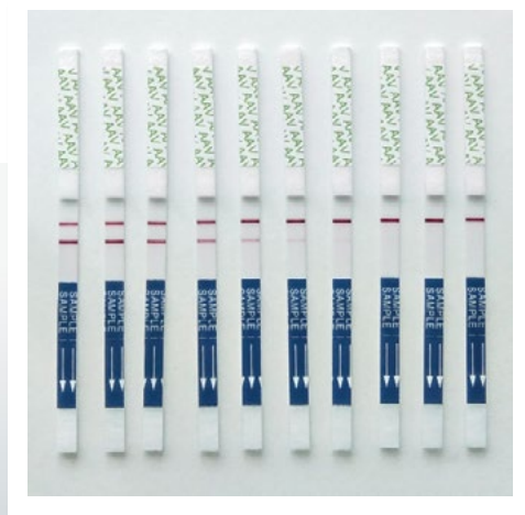
AAV test strips