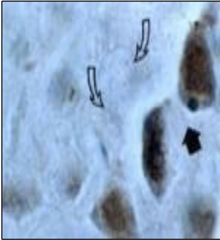
Fig:1 Formalin-fixed, paraffin-embedded section of dog ischemic brain stained for Active/Cleaved Caspase-3 expression using 20-1040 at 1:2000. Staining is seen in the nuclei of dying neurons (black arrow) but not in the morphologically normal nuclei (open arrows). Caspase-3 expression in the nucleus is considered to be a marker of active/caspase-3 expression and apoptosis. Hematoxylin-eosin counterstain.